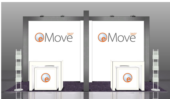
Stand Construction Demopoint (Pictures are showing 4 Demopoints)